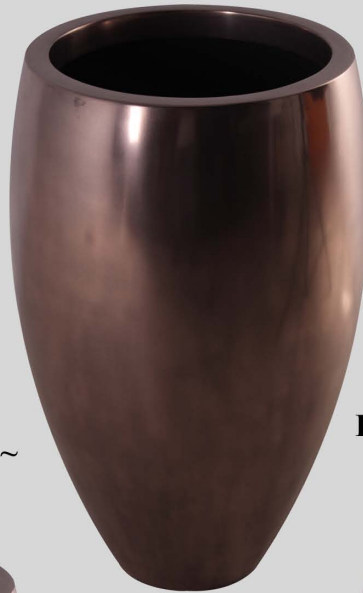
Polished Bronze 5BR81 ~ 20"W x 31.75"H

Our metal collection boasts real bronze and aluminum coatings. For a more contemporary and sophisticated look add these pieces to any home or office setting.