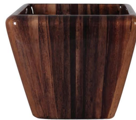
Abaca Neptune 22AB32 14.75"W x 12.5"H