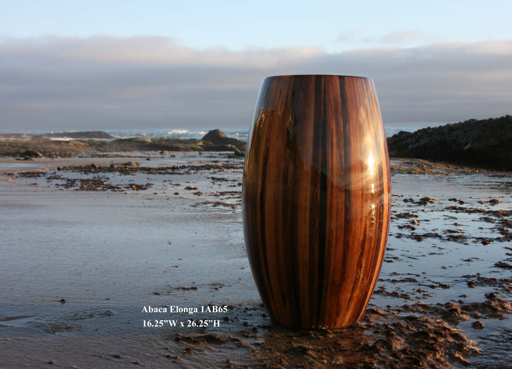
Abaca Elonga 1AB65 16.25"W x 26.25"H