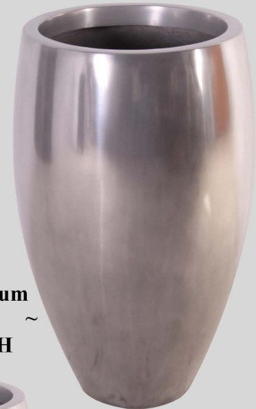
Polished Aluminum 5AL81 ~ 20"W x 31.75"H