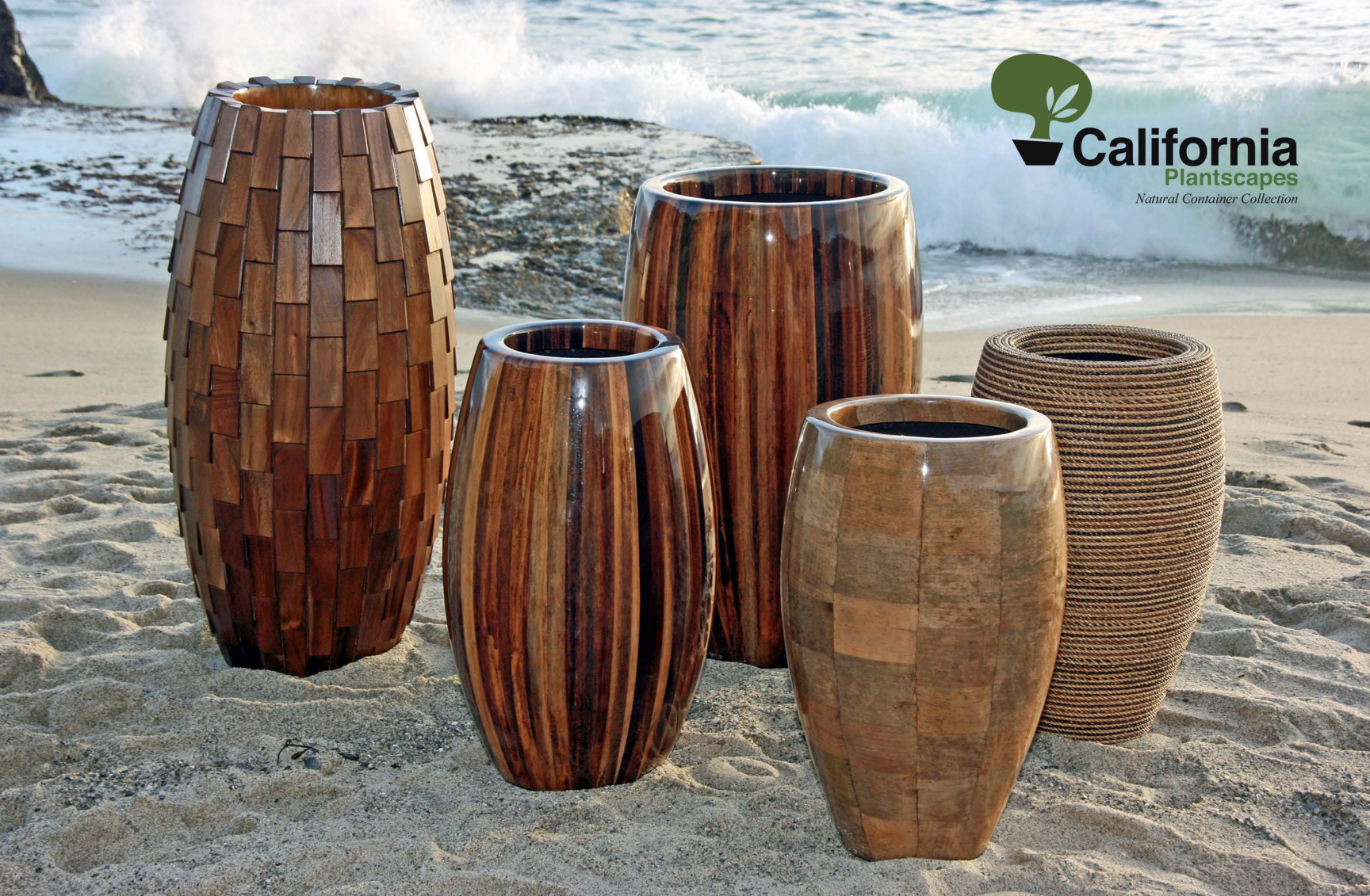
Banana Leaf - Abaca Bark - Acacia Wood - Banana Plant Fibers - Bronze Finish - Aluminum Finish