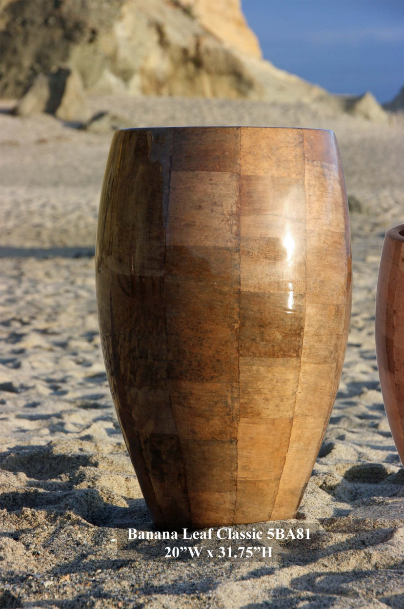
Banana Leaf Classic 5BA81 20"W x 31.75"H