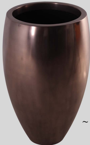
Polished Bronze 4BR61 ~ 15.5"W x 24.25"H