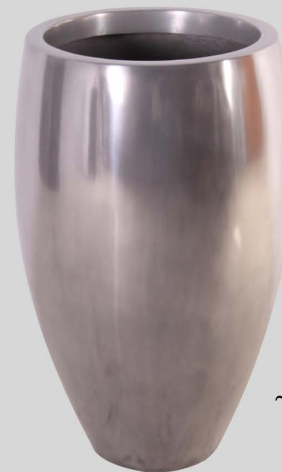
Polished Aluminum 4AL61 ~ 15.5"W x 24.25"H