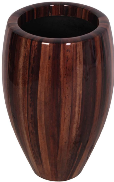
Abaca Classic 5AB81 20"W x 31.75"H

Made with Eco friendly materials these unique hand-made planters are a one of a kind! These planters are made from natural abaca bark a close relative of the banana tree. Once cured the bark is sized and carefully placed around the pot and then covered in several layers of resin for durability and a beautiful shine. With a modern simple design these Abaca Planters go perfectly with any contemporary or traditional room or space. As seen below these planters are available in various styles and sizes.