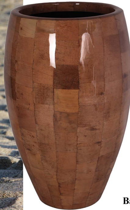
Banana Leaf Classic 4BA61 15.5"W x 24.25"H

These planters are made with hand picked banana leaves. The leaves are carefully selected and then are cut to size, cured, and ironed on piece by piece. The leaves are coated with several layers of resin creating a long lasting finish. Use these planters as a stand-alone showpiece or add your favorite indoor plants.